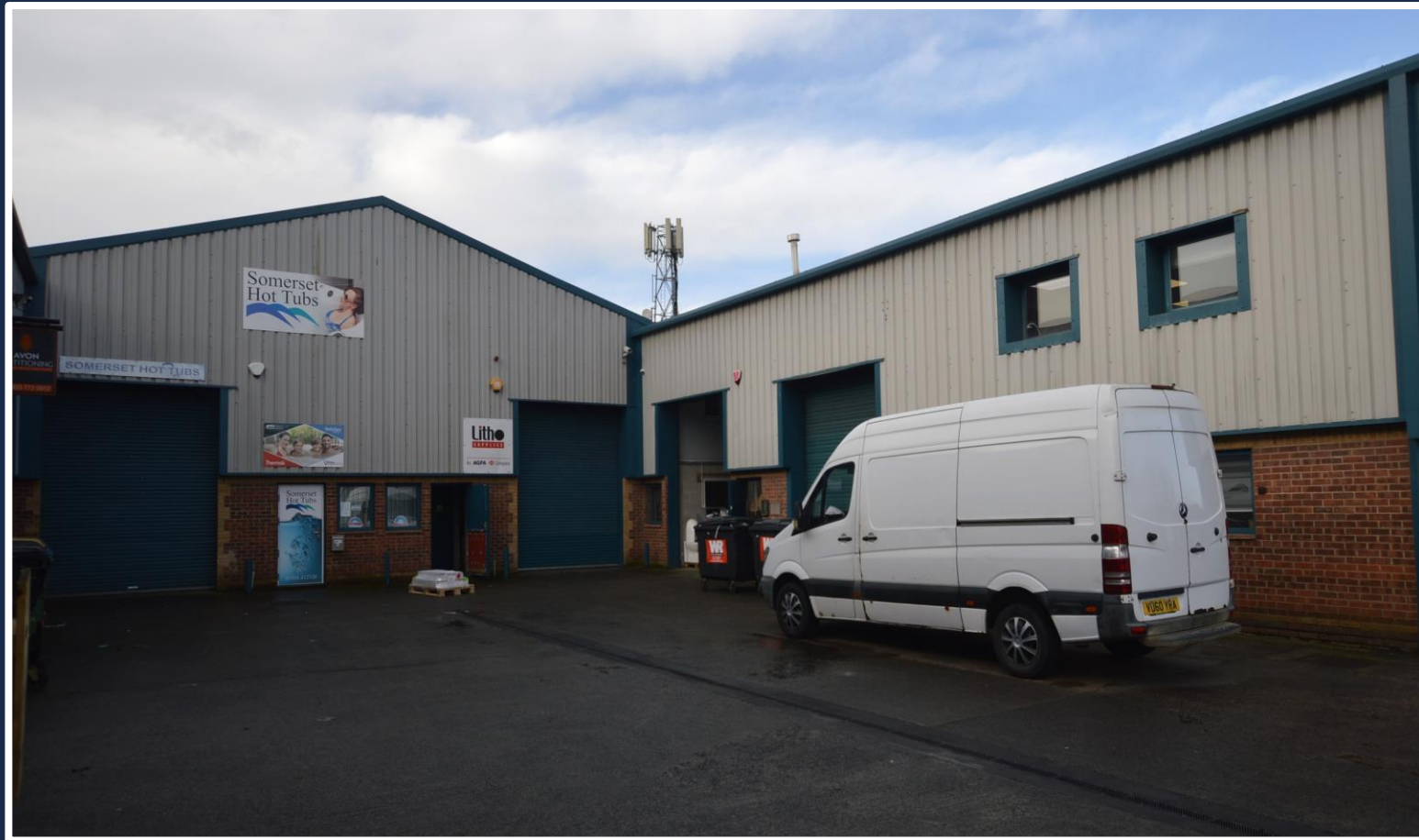
Unit 4, M T C Business Park Oldmixon Crescent, Weston-super-Mare, North Somerset, BS24 9AY